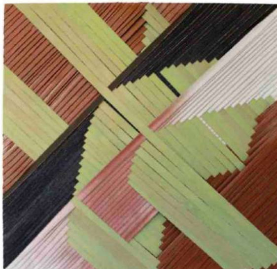
Arc Movements acrylic, latex, and varnish on canvas, torn and woven 36" x 36"

Frater's process begins with meticulous planning, where she carefully considers form, scale, and color choices, including underpainted hues. She paints directly onto unstretched, raw canvas with acrylic and latex viewing the large fields of vibrant color as "bodies." Frater then tears her canvases into strips, giving them a three-dimensional appearance and texture. She reassembles the pieces through weaving, folding, and sculpting, fashioning complex, new shapes and dimensions. Some strips are tightly twisted or braided, extending beyond the edge of the surface, while in others, they are woven or draped playfully within the confines of the canvas. The overall scale of the work often grows and swells in unexpected ways, with openings in the surface revealing the underlying structure and emphasizing the physicality of their creation.