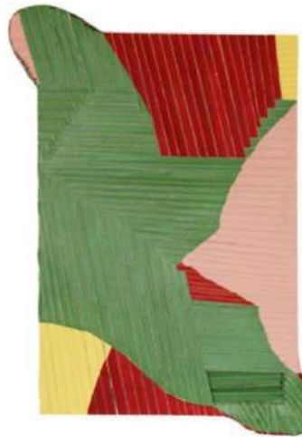
Hungry Sun acrylic and latex on canvas, torn and woven 38" x 26" x 2"