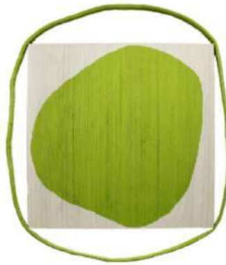
Encircled acrylic, enamel, and latex on canvas, torn and woven 90" x 70"