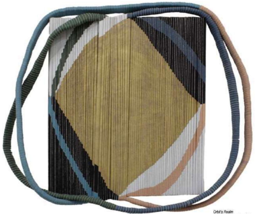
Orbit's Realm acrylic, latex, and varnish on canvas, form and woven 38" x 38"